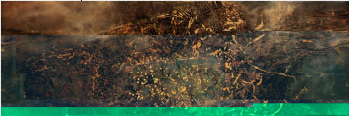
Nhat Tran, A Nonsensical Affection (2010)