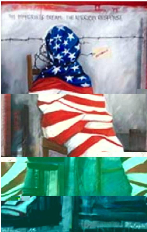
The Immigrant's Dream: The American Response