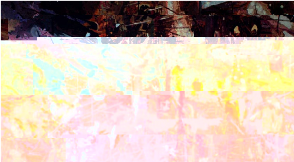
Orie Shafer Angela's Vision (2010), oil and mixed media on canvas, 38 in x 72 in